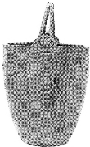
Fig. 1. The inscribed situla from Graešnica (Upper Macedonia), ca. 300 B.C.